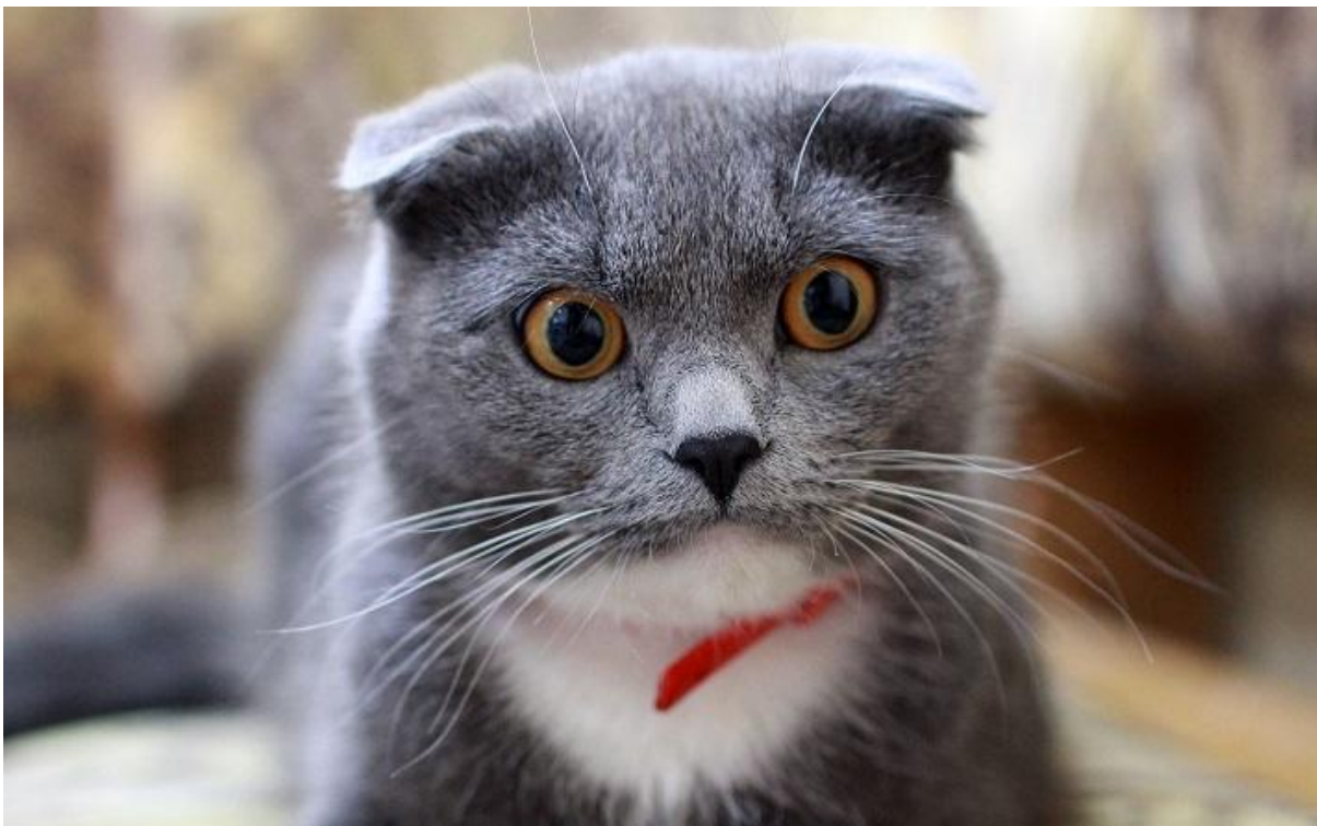
The folded ears cause painful joints.

Are flat muzzles and folded ears cute? Not at all, if these characteristics cause day and night misery for a pet and a lot of care, grief and sky-high costs for the owner. Take a stand, show in your media statements that you are not participating in this! Only show dogs and cats that are healthy and happy.